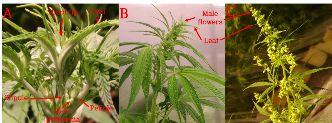
Fig. 1. Male plants at the time of ethephon treatment after male primordia formation, soon after (A), 7 days later (B) and 14 days later (C). At the time of primordia formation, primordia were formed between stipule and petiole under shoot tip. At time goes on, leaves became smaller, decreased and more flowers were formed.

characteristics of seeds and germination rate were investigated using harvested seeds. The plant ratio of female flower formation was measured with ten plants per replicate. Of the ten plants, we counted the number of plants that formed stigma and calyx, and calculated the percentage. Stem height was measured from the distal end to the apex. The number of branches was counted from the first branch attached to the trunk. The number of fruiting nodes on the branch was counted as seed bearing nodes on the longest branch.