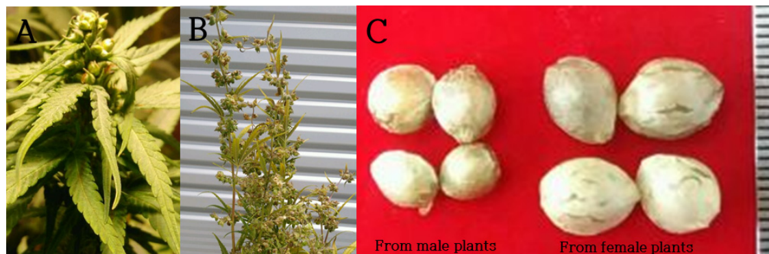
Fig. 4. Seed formation of female (A), male plants (B) and size comparison between seeds from male and female plants (C). In Figure C, each marking on the ruler is 0.5 mm.

z Mean separation within columns by Duncan's multiple range test at p = 0.05 .